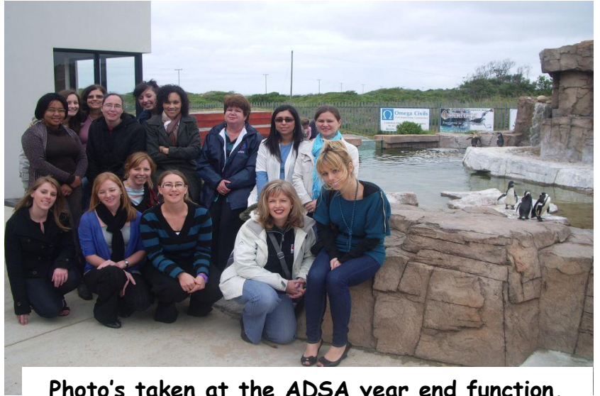
Photo's taken at the ADSA year end function.