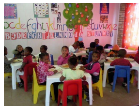
This photo was taken at a local crèche in Jeffrey's Bay.

ADSA Eastern Cape Branch would like to thank everyone who promoted healthy eating (and Dietetics) during that week.